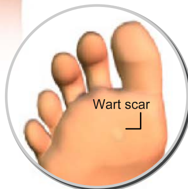
FOOT AFTER TREATMENT