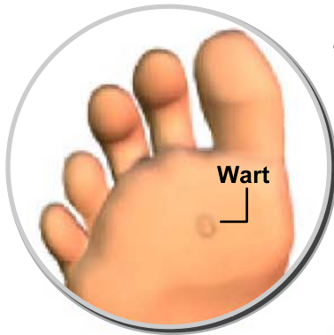
FOOT BEFORE TREATMENT