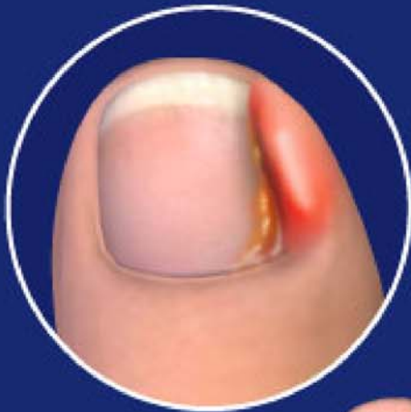
Toenail may become infected